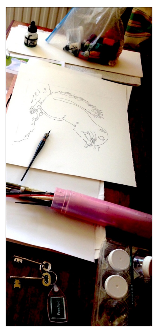
Hotel room "studio"