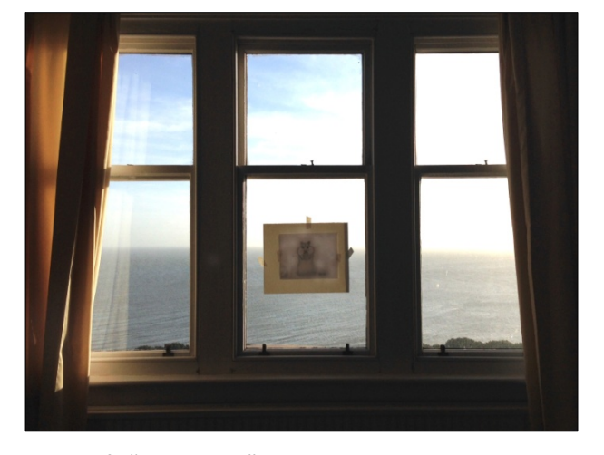
Makeshift "light table" in hotel with chipmunk sketch